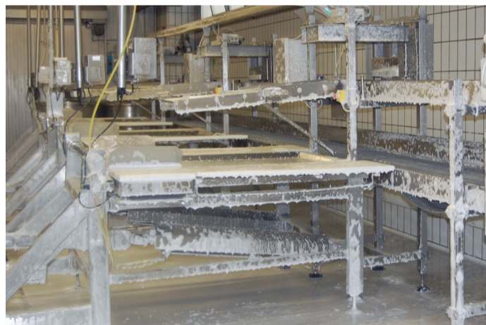
② Chemical action