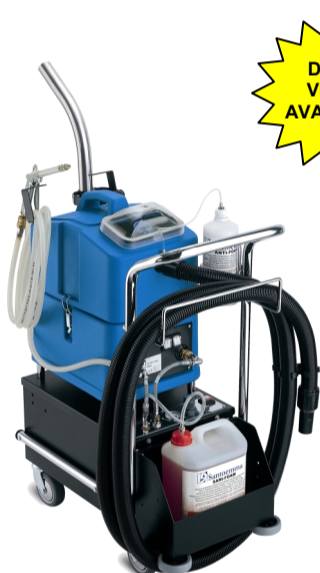
FRV FOOD 15

IdroFoamRinse FOOD is an innovative machine, electrically powered, allowing to spray foam and rinse continuously. The water used for foaming and rinsing is directly taken from the water network, therefore the machine has an unlimited autonomy. Pure chemical is contained in its separate tank and it is automatically used by the machine in a controlled quantity. IdroFoamRinse FOOD is indicated to clean all the areas where the presence of a drain in the floor makes vacuuming not necessary.