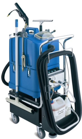
FRV FOOD 30