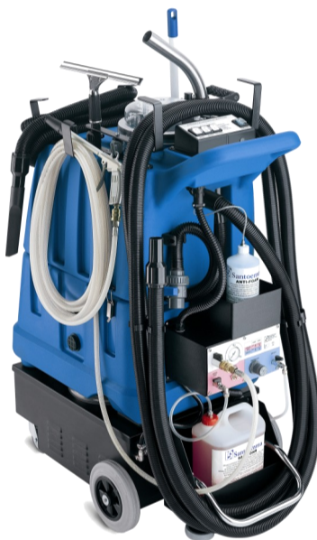
FRV FOOD 70

FRV FOOD range includes three machines able to spray foam, rinse and vacuum the residual liquid from floor. The three models, with different vacuum capacities and autonomies, have been specifically designed to better adapt to places of different sizes.